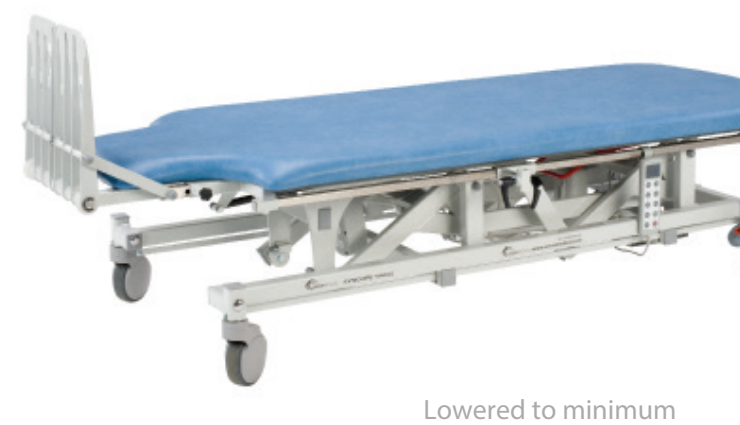
height for patient transfer