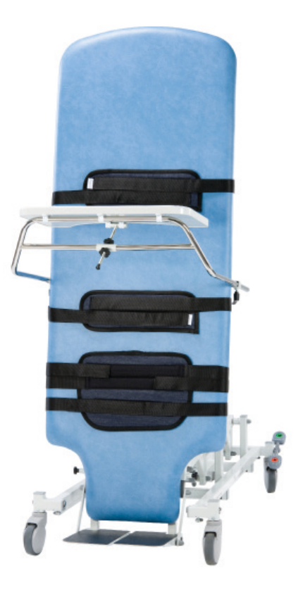
Set of harnesses & worktable included as standard