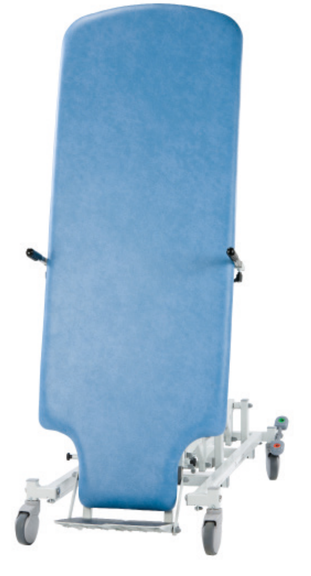
Model ST7645 Colour Sky Blue