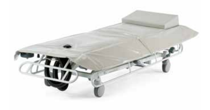
Model ST7700 Shown at Minimum Height for patient transfer, with all side rails down.