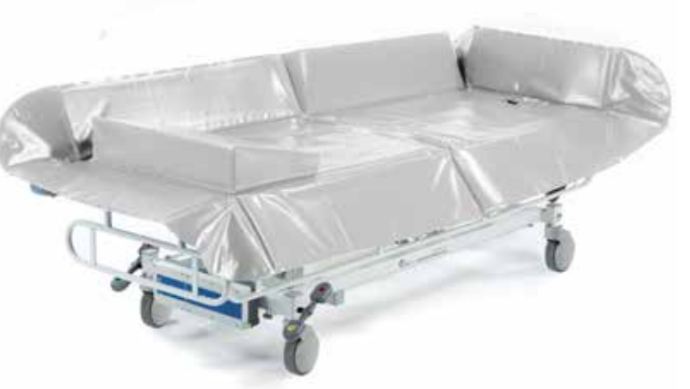
Model ST7800 Electric Adult Shower Trolley