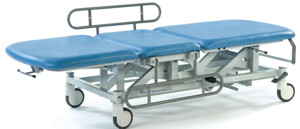
Low patient transfer height

See page 50-51 for additional information on our range of optional accessories