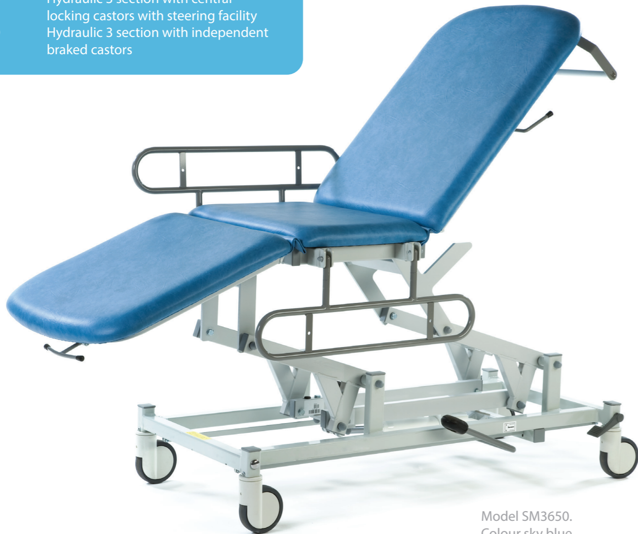
Model SM3650. Colour sky blue