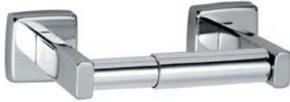
AI0113C Bright finish

Single roll toilet tissue dispenser / Surface mounted