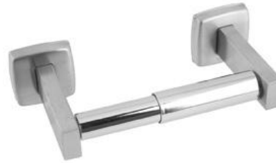
AI0113CS Satin finish