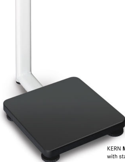
KERN MPS-PM with stand