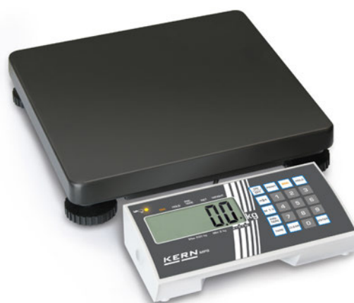
KERN MPS-M with free-standing display device