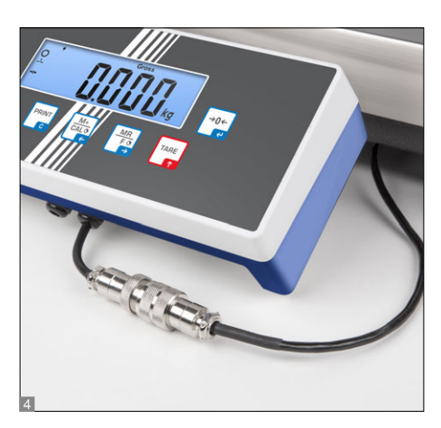
Verification plug, for verified balances this enables you to separate the display device and platform without affecting the verification