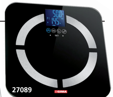
Weight and analysis of results shown on scale