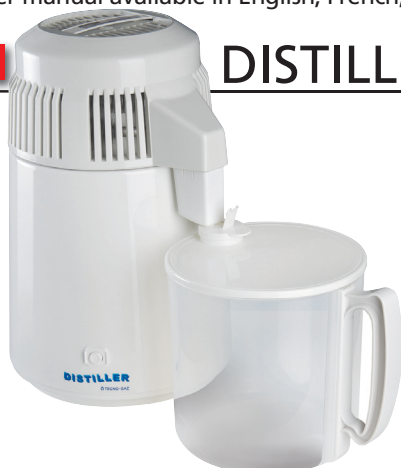
Size Ø 20 cm x h 36 cm