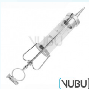
JANET SYRINGE 200ML Model:VUBU-10-88920