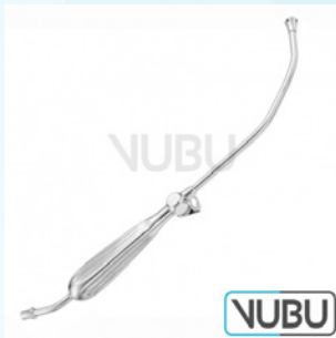
WALTON-YANKAUER SUCTION TUBE Model:VUBU-10-42300