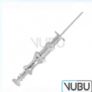
KLIMA-ROSSEGGER CANNULA Ø 1,8MM X 35MM Model:VUBU-10-67918