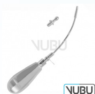
PIERCE MAXILLA TROCAR WIDTH TUBE CONNECTION Ø 5,0MM Model:VUBU-10-20950