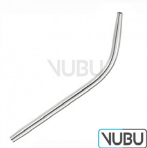
DENTAL SUCTION TUBE Ø 6,0MM 14,0CM Model:VUBU-10-48206