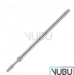
POOLE SUCTION TUBE STRAIGHT Ø 10MM 22,0CM Model:VUBU-10-43922