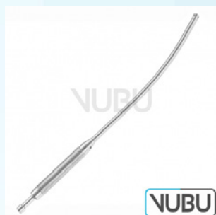
COOLEY SUCTION TUBE Ø 8MM 35,0CM Model:VUBU-10-44302