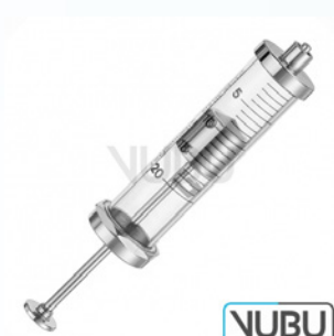
VACUUM GLASS BARREL SYRINGE 50 ML Model:VUBU-10-88805