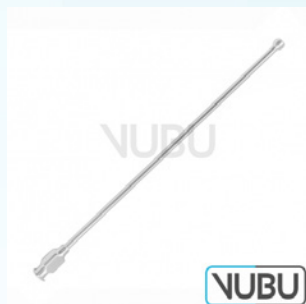
SCHMID CANNULA Ø 6MM 15,0CM Model:VUBU-10-75906