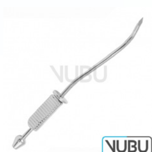
DOUGLAS TROCAR Ø 3MM 11,0CM Model:VUBU-10-20400