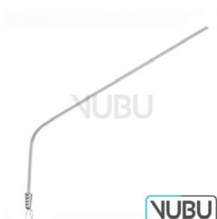
SUCTION TUBE Ø 2,0MM 13,0CM Model:VUBU-10-46013