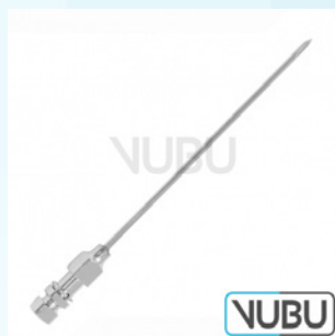
LANDAU TROCAR Ø 2,0MM Model:VUBU-10-18916