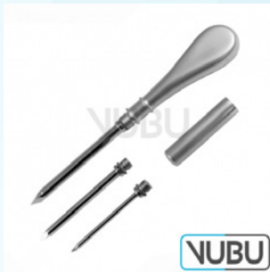
UNIVERSAL TROCARS SET OF 3 FLAT HANDLE Model:VUBU-10-12903