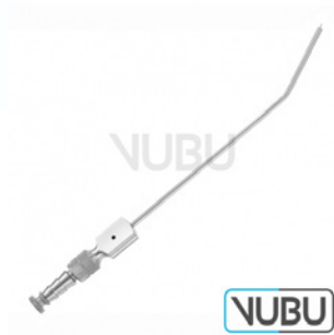
PLESTER SUCTION TUBE Ø 1,5MM Model:VUBU-10-45115