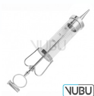
JANET SYRINGE 200ML Model:VUBU-10-88920