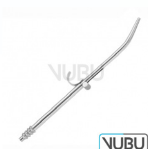
BYRD SUCTION TUBE Ø 1,5MM 15,0CM Model:VUBU-10-43115