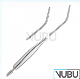
COUPLAND SUCTION TUBE 27,0CM Model:VUBU-10-42900