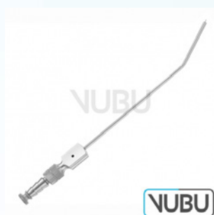
PLESTER SUCTION TUBE Ø 3,0MM Model:VUBU-10-45130