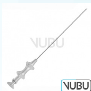
EICKEN TROCAR Ø 2,0MM X 105MM Model:VUBU-10-19520