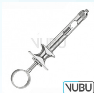
CYLINDER CARTRIDGE SYRINGE WITH ASPIRATION 1,8ML Model:VUBU-10-88018