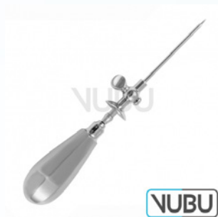
STANDARD TROCAR WIDTH SHIELD AND STOPCOCK Ø 5,0MM 12,0CM Model:VUBU-10-14150