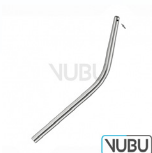
COUPLAND SUCTION TUBE Ø 3,5MM WITH SIDE HOLE Model:VUBU-10-46704