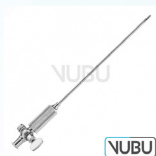
VERRES CANNULA Ø 2,0MM X 100MM Model:VUBU-10-79910