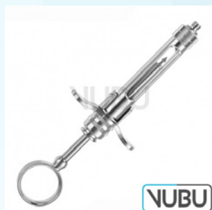
CYLINDER CARTRIDGE SYRINGE FOR THREE FINGERS 1,8ML Model:VUBU-10-88418