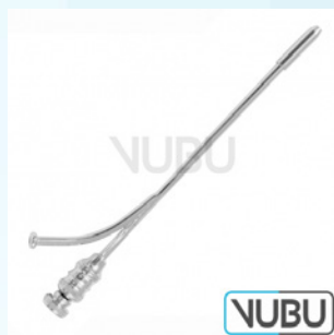
OCHSNER TROCAR 14 CHARR Model:VUBU-10-17914