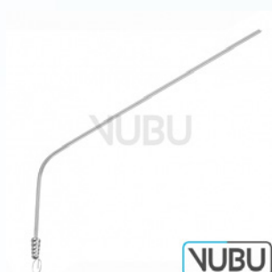
SUCTION TUBE Ø 2,5MM 13,0CM Model:VUBU-10-46113