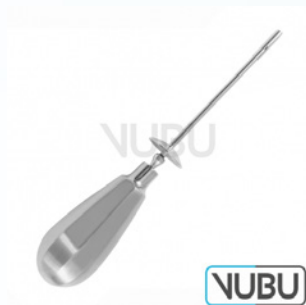
STANDARD TROCAR WIDTH SHIELD Ø 6,0MM 11,0CM Model:VUBU-10-13960