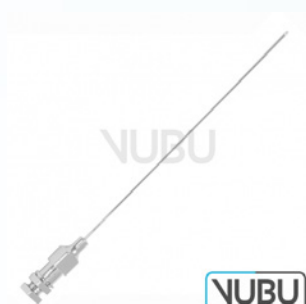
QUINKE BIOPSY CANNULA Ø 0,7MM X 76MM Model:VUBU-10-73901