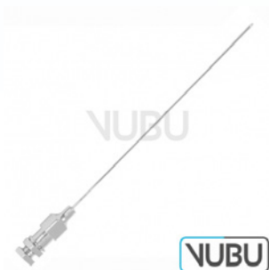
QUINKE BIOPSY CANNULA Ø 1,2MM X 76MM Model:VUBU-10-73905