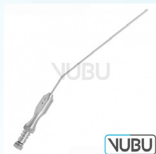
FRAZIER SUCTION TUBE 6 CHARR Model:VUBU-10-44906