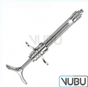
CYLINDER CARTRIDGE SYRINGE WITHOUT ASPIRATION 1,8ML Model:VUBU-10-88118