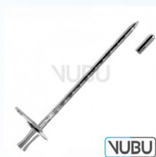
CAMPBELL TROCAR Ø 6MM 16,0CM Model:VUBU-10-16706