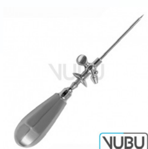
STANDARD TROCAR WIDTH SHIELD STOPCOCK AND TUBE Ø 6,0MM 12,0CM Model:VUBU-10-14360