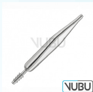
COUPLAND SUCTION HANDLE Model:VUBU-10-48401