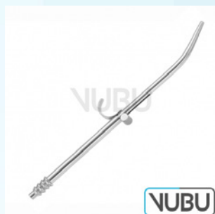
BYRD SUCTION TUBE Ø 3,5MM 15,0CM Model:VUBU-10-43135