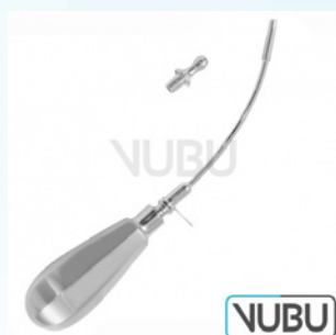
PIERCE MAXILLA TROCAR WIDTH TUBE CONNECTION Ø 5,0MM Model:VUBU-10-20950