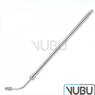
POOLE SUCTION TUBE CURVED Ø 8MM 22,0CM Model:VUBU-10-44022