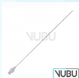
SINGLE CANNULA FOR IOWA TROMPET VUBU-10-76914 14CM 1MM Model:VUBU-10-76914_kan