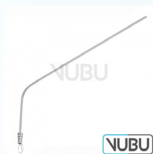
SUCTION TUBE Ø 2,5MM 13,0CM Model:VUBU-10-46113