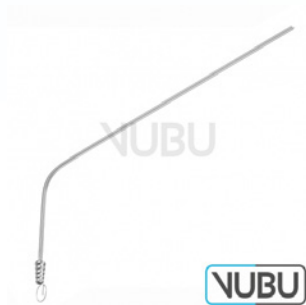
SUCTION TUBE Ø 1,5MM 13,0CM Model:VUBU-10-45913