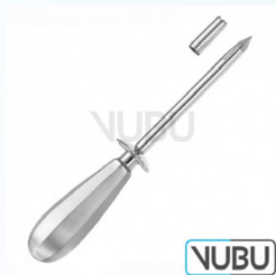
NELSON TROCAR FIG-2 Ø 9,5MM 21,0CM Model:VUBU-10-15902