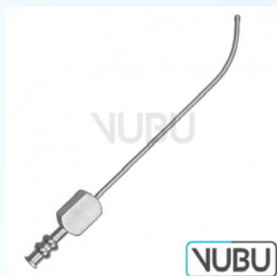
EICKEN-KILLIAN SUCTION TUBE Ø 2,5MM Model:VUBU-10-45503