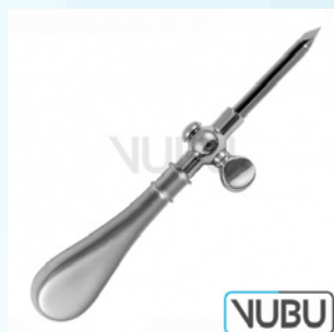
BUELAU TROCAR Ø 8MM 24,0CM Model:VUBU-10-16300