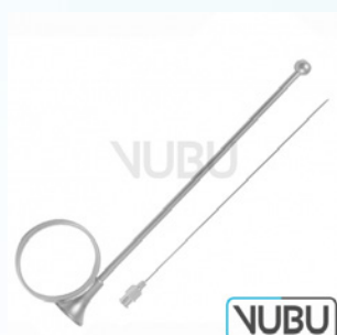
IOWA TROMPET AND CANNULA 14,0CM Model:VUBU-10-76914