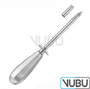
NELSON TROCAR FIG-1 Ø 7,5MM 21,0CM Model:VUBU-10-15901