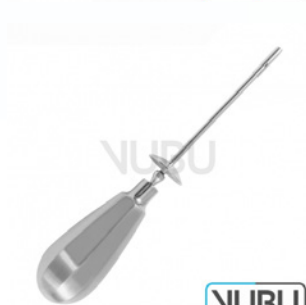
STANDARD TROCAR WIDTH SHIELD Ø 3,0MM 11,0CM Model:VUBU-10-13930