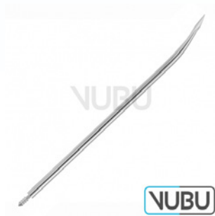
GUIDE NEEDLE 16 CHARR Model:VUBU-10-83916