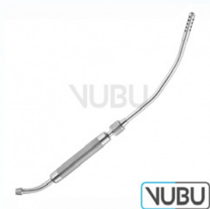
COOLEY SUCTION TUBE Ø 8MM 33,0CM Model:VUBU-10-44301