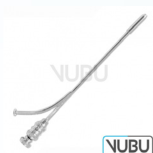
OCHSNER TROCAR 20 CHARR Model:VUBU-10-17920