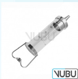
JANET CYLINDER 200ML Model:VUBU-10-89020