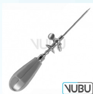
STANDARD TROCAR WIDTH SHIELD STOPCOCK AND TUBE Ø 3,0MM 12,0CM Model:VUBU-10-14330