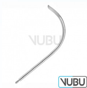
GUIDE NEEDLE 14 CHARR Model:VUBU-10-84114