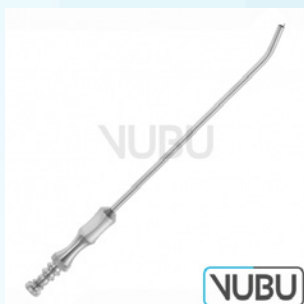
ADSON SUCTION TUBE Ø 4MM 21,0CM Model:VUBU-10-46904