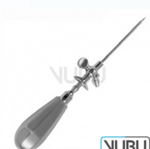
STANDARD TROCAR WIDTH SHIELD STOPCOCK AND TUBE Ø 6,0MM 12,0CM Model:VUBU-10-14360