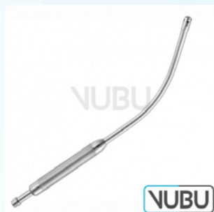
COOLEY SUCTION TUBE Ø 10MM 30,0CM Model:VUBU-10-44304