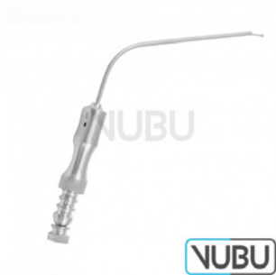
FERGUSON SUCTION TUBE 6 CHARR Model:VUBU-10-45306