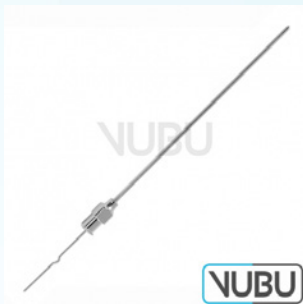
MENGHINI BIOPSY CANNULA Ø 1,4MM X 168MM Model:VUBU-10-73614