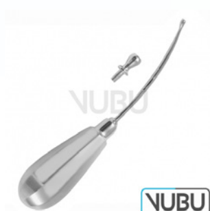
KRAUSE TROCAR Ø 5,5MM 15,0CM Model:VUBU-10-21355