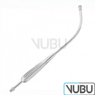
DE BAKEY SUCTION TUBE Model:VUBU-10-42700