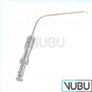
FERGUSON SUCTION TUBE 6 CHARR Model:VUBU-10-45306