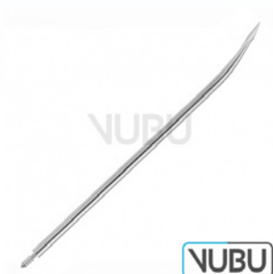
GUIDE NEEDLE 8 CHARR Model:VUBU-10-83908