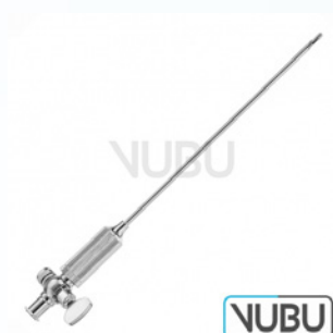
VERRES CANNULA Ø 2,0MM X 120MM Model:VUBU-10-79912