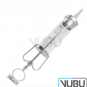
JANET SYRINGE 100ML Model:VUBU-10-88910