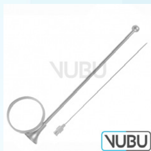
IOWA TROMPET AND CANNULA 14,0CM Model:VUBU-10-76914