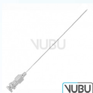
QIUNKE BIOPSY CANNULA Ø 0,7MM X 89MM Model:VUBU-10-73902