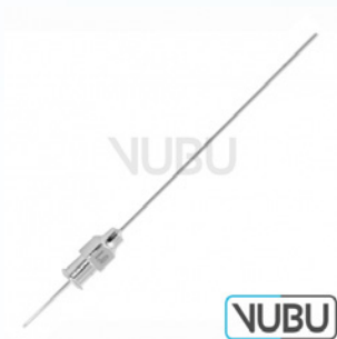
MENGHINI BIOPSY CANNULA Ø 1,6MM X 70MM Model:VUBU-10-73407