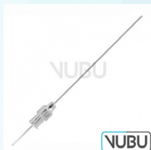
MENGHINI BIOPSY CANNULA Ø 1,2MM X 70MM Model:VUBU-10-73403