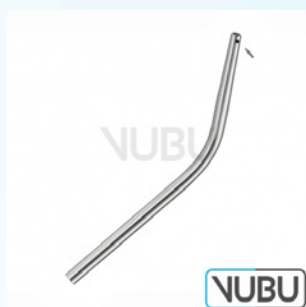
COUPLAND SUCTION TUBE Ø 2,0MM WITH SIDE HOLE Model:VUBU-10-46702