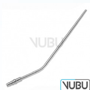
LUER SUCTION TUBE Ø 3,5MM 11,0CM Model:VUBU-10-48035