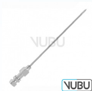
TUOHY NEEDLE Ø 1,2MM X 80MM Model:VUBU-10-70916