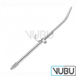
BYRD SUCTION TUBE Ø 2,5MM 15,0CM Model:VUBU-10-43125