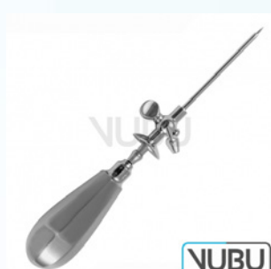
STANDARD TROCAR WIDTH SHIELD STOPCOCK AND TUBE Ø 5,0MM 12,0CM Model:VUBU-10-14350