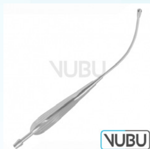
ANDREW-PINCHON SUCTION TUBE Model:VUBU-10-42500