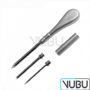
UNIVERSAL TROCARS SET OF 3 FLAT HANDLE Model:VUBU-10-12903