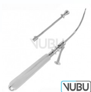
COAKLEY ANTRUM TROCAR SET Ø 2,25MM Model:VUBU-10-21916