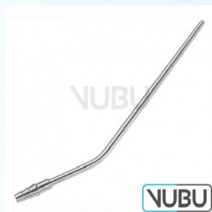
LUER SUCTION TUBE Ø 3,5MM 11,0CM Model:VUBU-10-48035