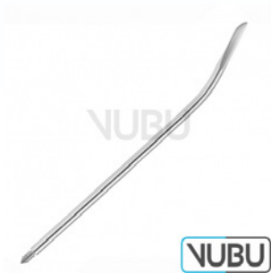
GUIDE NEEDLE 16 CHARR Model:VUBU-10-84016