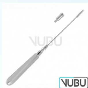
LICHTWITZ TROCAR STRAIGHT Ø 1,8MM Model:VUBU-10-19900