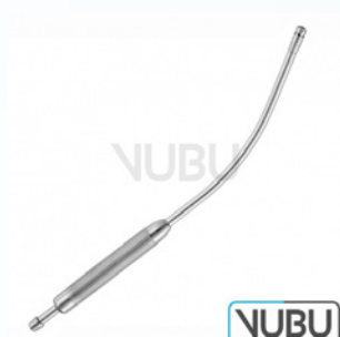
COOLEY SUCTION TUBE Ø 6MM 30,0CM Model:VUBU-10-44303