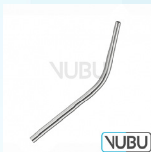
COUPLAND SUCTION TUBE Ø 2,0MM Model:VUBU-10-46602