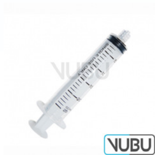
DISPOSABLE SYRINGE 80PCS 20ML Model:VUBU-10-89402