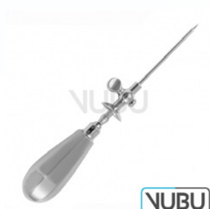
STANDARD TROCAR WIDTH SHIELD AND STOPCOCK Ø 5,0MM 12,0CM Model:VUBU-10-14150