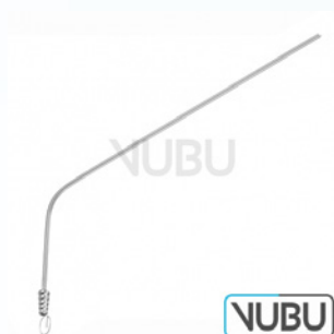
SUCTION TUBE Ø 2,0MM 13,0CM Model:VUBU-10-46013