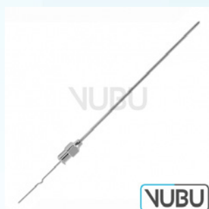
MENGHINI BIOPSY CANNULA Ø 1,8MM X 168MM Model:VUBU-10-73618