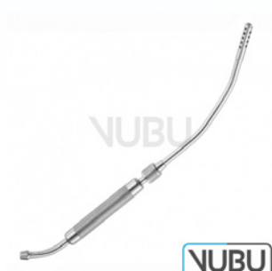
COOLEY SUCTION TUBE Ø 8MM 33,0CM Model:VUBU-10-44301