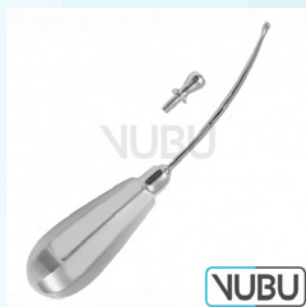
KRAUSE TROCAR Ø 5MM 15,0CM Model:VUBU-10-21350