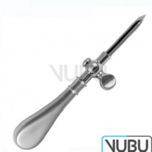
BUELAU TROCAR Ø 8MM 24,0CM Model:VUBU-10-16300