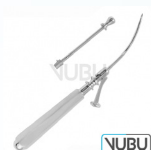
COAKLEY ANTRUM TROCAR SET Ø 2,25MM Model:VUBU-10-21916