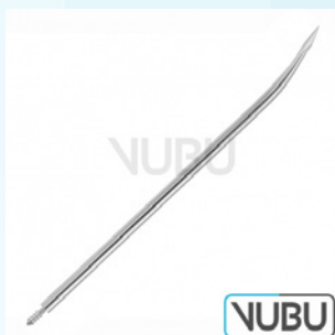
GUIDE NEEDLE 8 CHARR Model:VUBU-10-83908