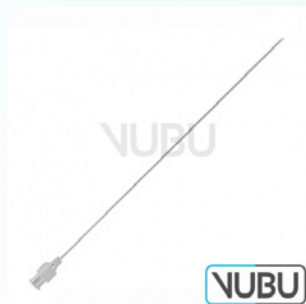
SINGLE CANNULA FOR IOWA TROMPET VUBU-10-76914 14CM 1MM Model:VUBU-10-76914_kan