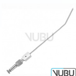
PLESTER SUCTION TUBE Ø 1,5MM Model:VUBU-10-45115