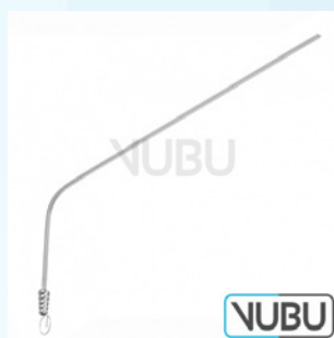
SUCTION TUBE Ø 1,5MM 13,0CM Model:VUBU-10-45913