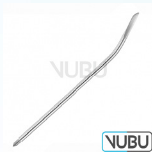
GUIDE NEEDLE 14 CHARR Model:VUBU-10-84014