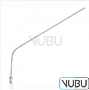
SUCTION TUBE Ø 3,5MM 22,0CM Model:VUBU-10-46222