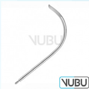
GUIDE NEEDLE 16 CHARR Model:VUBU-10-84116