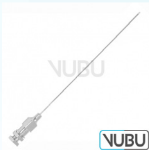
QUINKE BIOPSY CANNULA Ø 0,7MM X 76MM Model:VUBU-10-73901