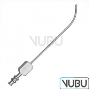
EICKEN-KILLIAN SUCTION TUBE Ø 2,5MM Model:VUBU-10-45503