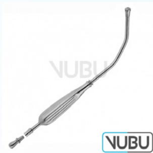
YANKAUER SUCTION TUBE COMPLETE Model:VUBU-10-41900