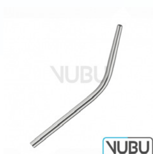
COUPLAND SUCTION TUBE Ø 3,5MM Model:VUBU-10-46604