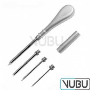
UNIVERSAL TROCARS SET OF 4 FLAT HANDLE Model:VUBU-10-12904