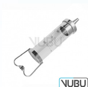
JANET CYLINDER 100ML Model:VUBU-10-89010