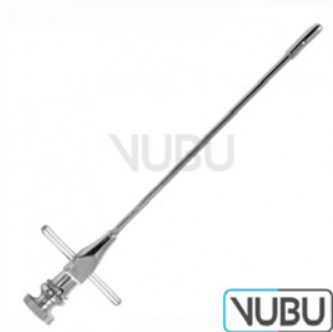
LICHTWITZ TROCAR Ø 1,6MM 11,0CM Model:VUBU-10-20100