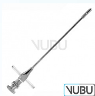
LICHTWITZ TROCAR Ø 1,6MM 11,0CM Model:VUBU-10-20100