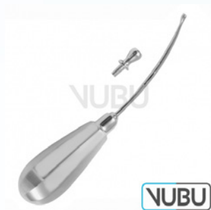
KRAUSE TROCAR Ø 5,5MM 15,0CM Model:VUBU-10-21355