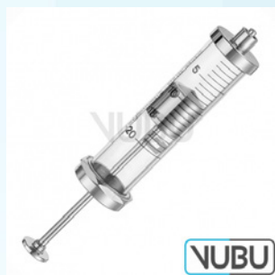
VACUUM GLASS BARREL SYRINGE 50 ML Model:VUBU-10-88805