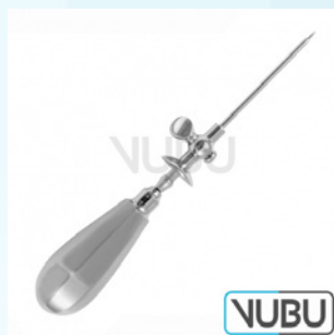
STANDARD TROCAR WIDTH SHIELD AND STOPCOCK Ø 6,0MM 12,0CM Model:VUBU-10-14160