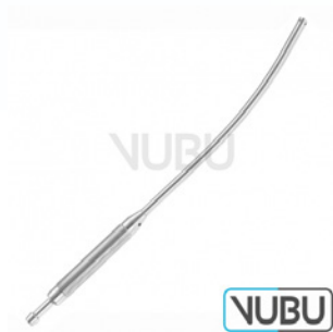
COOLEY SUCTION TUBE Ø 8MM 35,0CM Model:VUBU-10-44302