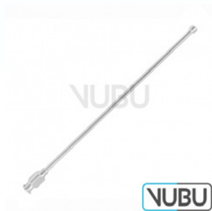
SCHMID CANNULA Ø 6MM 15,0CM Model:VUBU-10-75906