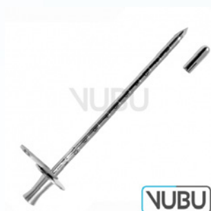
CAMPBELL TROCAR Ø 8MM 16,0CM Model:VUBU-10-16708