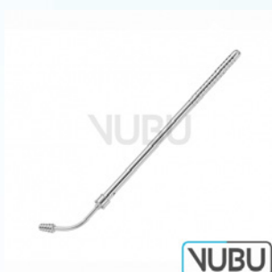
BABY-POOLE SUCTION TUBE Ø 5,5MM Model:VUBU-10-44120