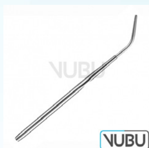
COGSWELL SUCTION TUBE Ø 2MM 24,5CM Model:VUBU-10-47920